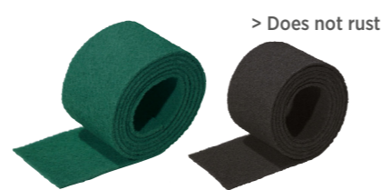
Mercury 35 & 84

Abrasive scourer roll, cuttable to required size, produced with grease-stop treatment to stop build up of fats and oils