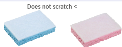
Sponrex 79 & 31

Dual function cellulosic sponge scourers for powerful effective cleaning on non delicate surfaces