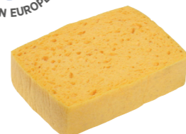
100% biodegradable <